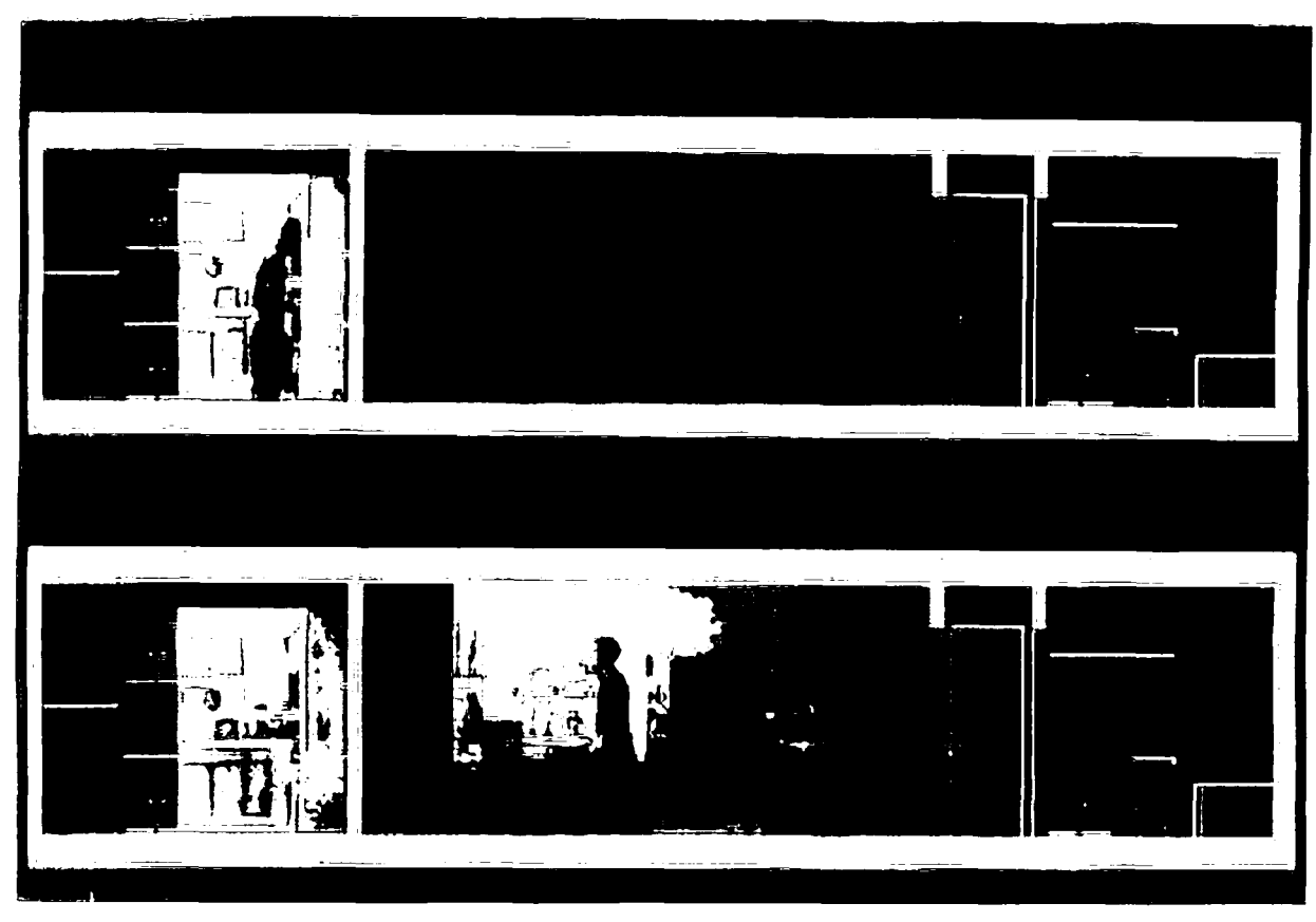
Figure 1. Section which fluctuates between a drawing and a story